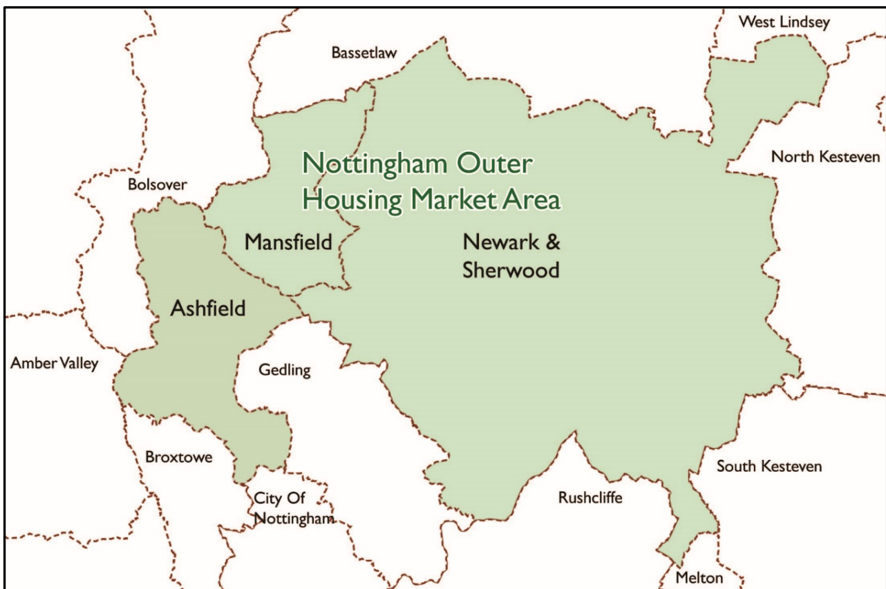
Map 2: Nottingham Outer Housing Market Area