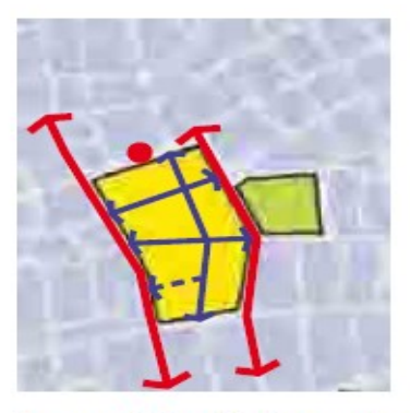
A more pedestrian friendly approach that integrates with the surrounding community. It links existing and proposed streets and provides direct routes to bus stops.