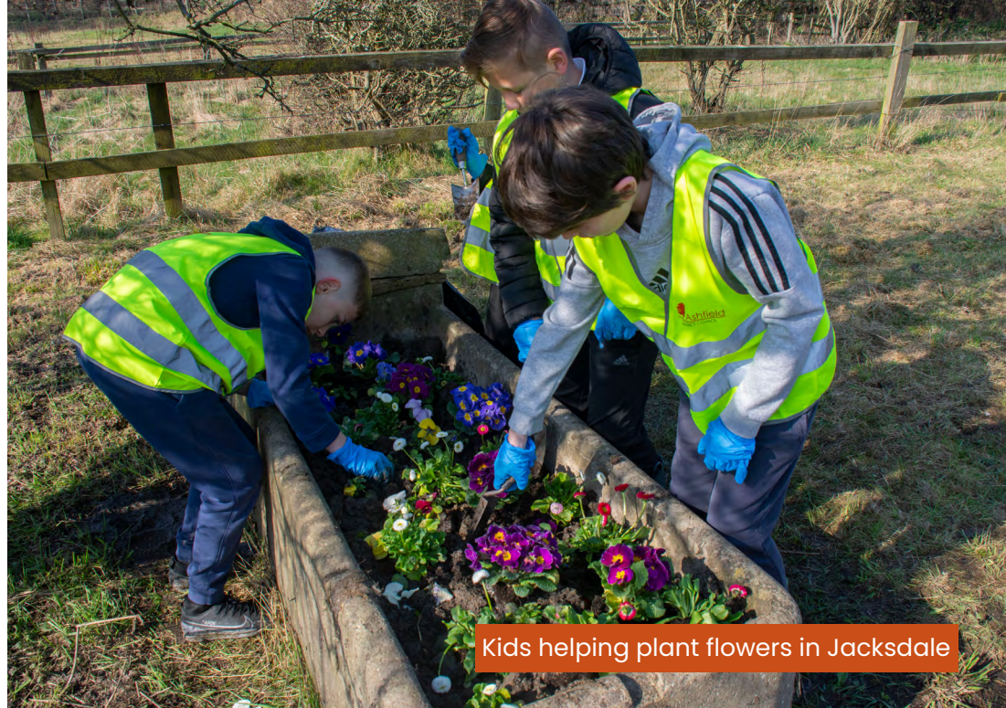
Kids helping plant flowers in Jacksdale