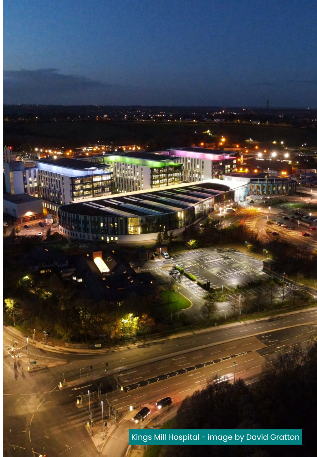
Kings Mill Hospital

The Corporate Plan also aligns with relevant partnership strategies, providing a structured and consolidated approach to successful delivery.