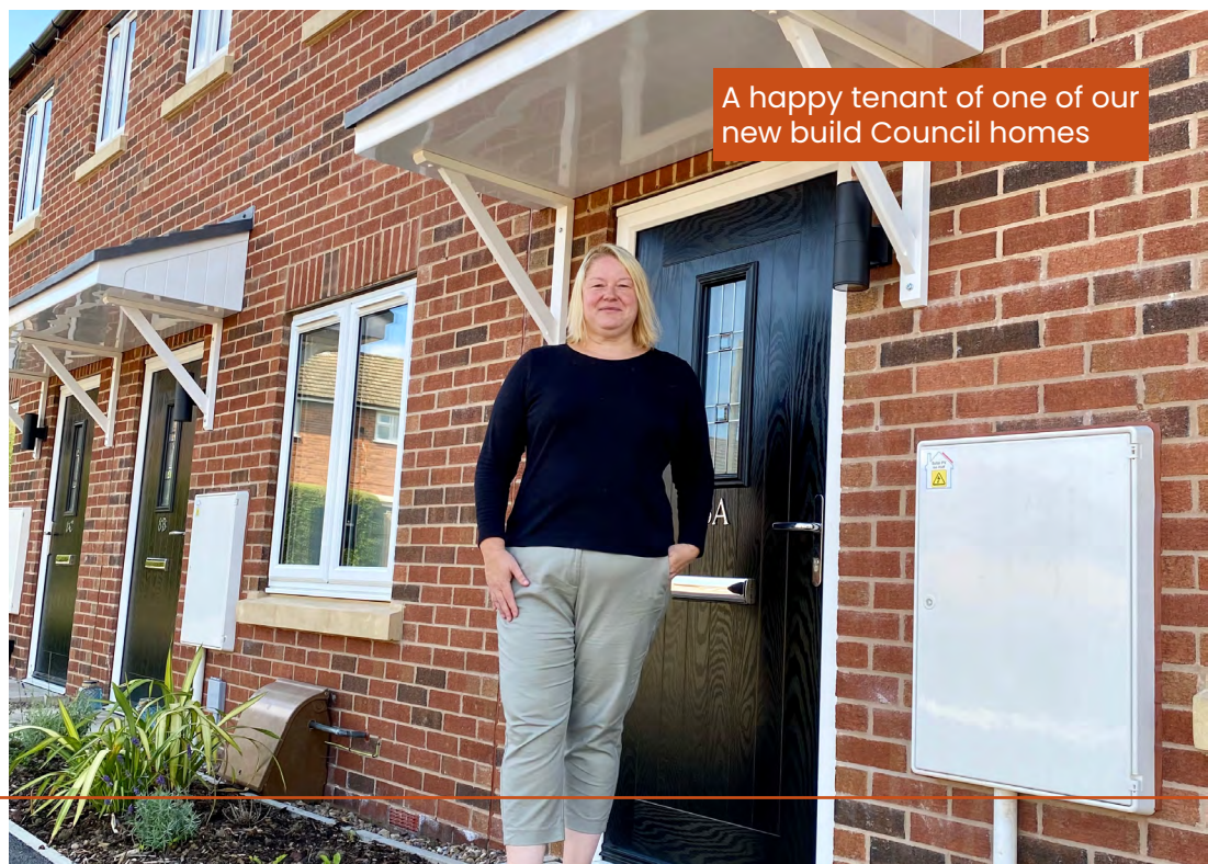
A happy tenant of one of our new build Council homes