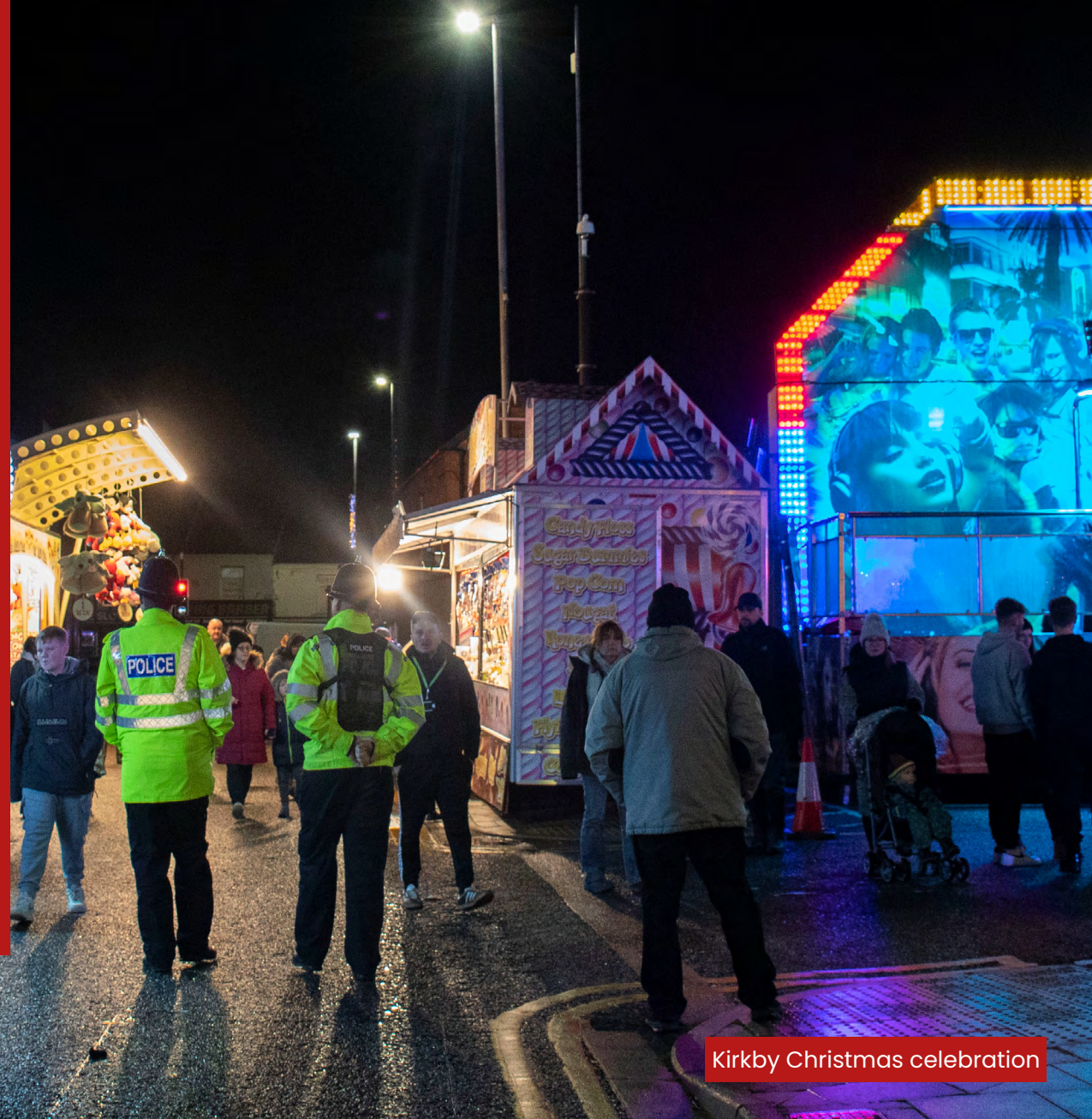
Kirkby Christmas celebration

We will provide an evidence-based, performance-led approach to help drive activity where it is most needed and most effective.