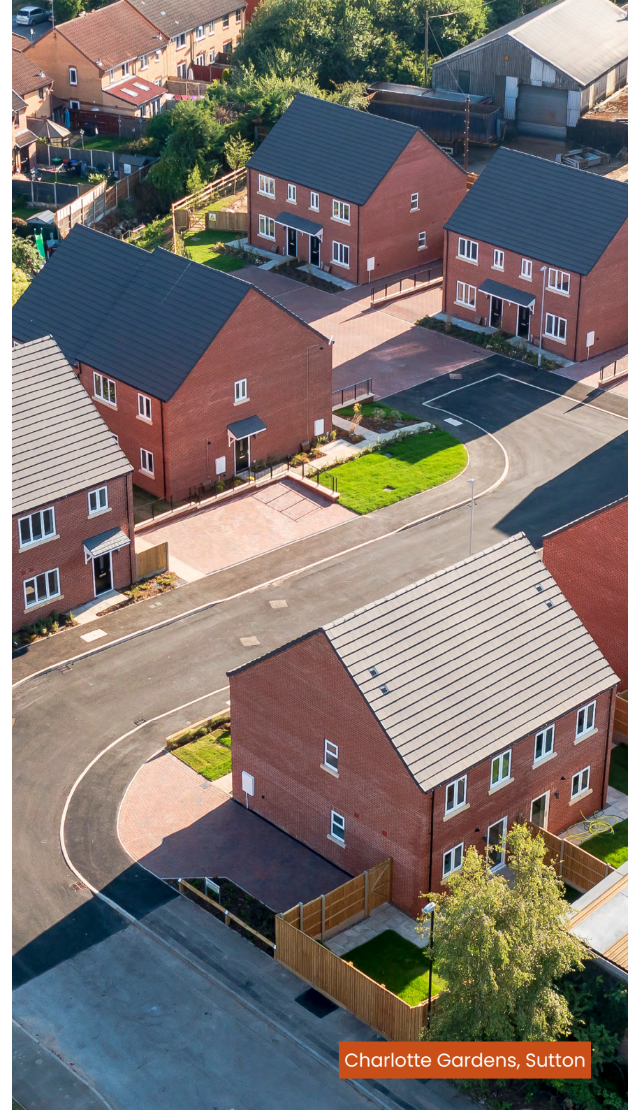
Charlotte Gardens, Sutton