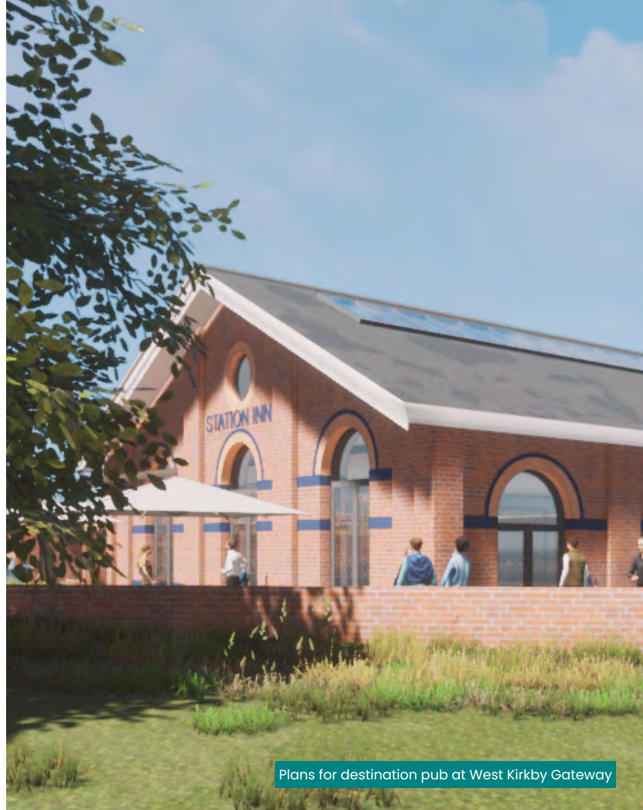
Plans for destination pub at West Kirkby Gateway

Every four years we will undertake a Peer Challenge Review, engaging peers from across the sector through the Local Government Association sector led improvement offer, with an independent evaluation of the organisation focused on leadership, governance, corporate capacity and financial resilience.