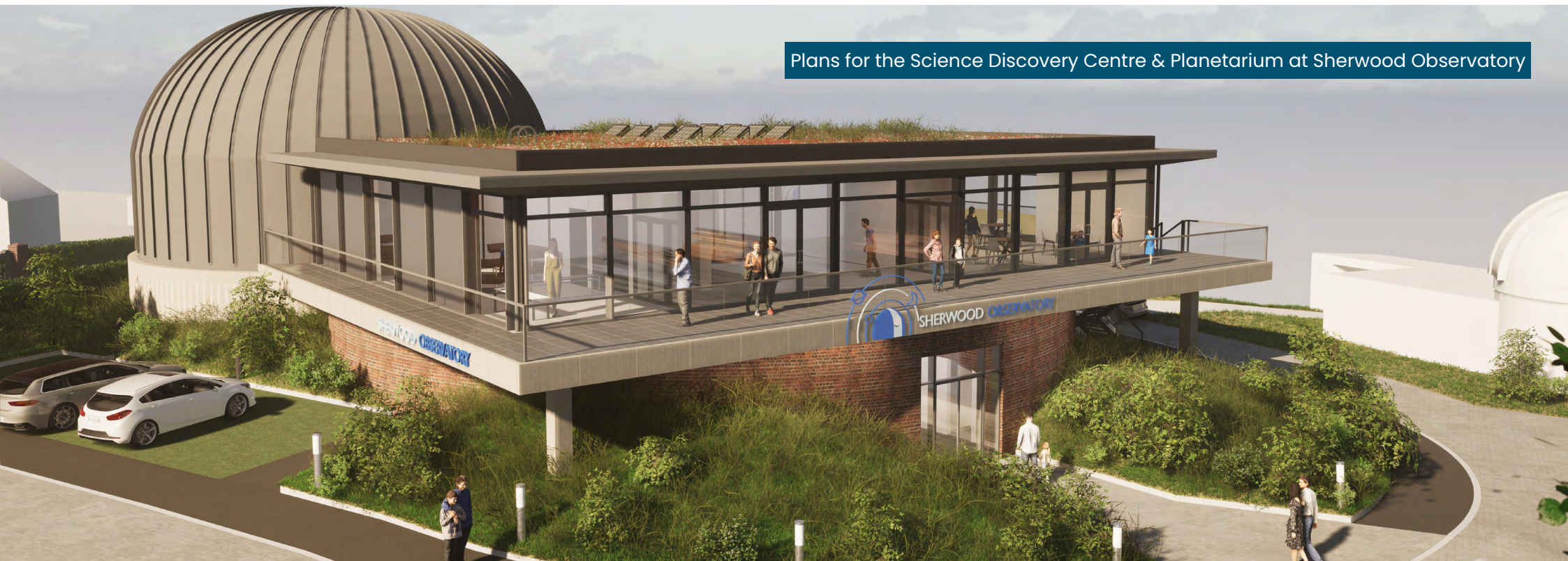
Plans for the Science Discovery Centre & Planetarium at Sherwood Observatory