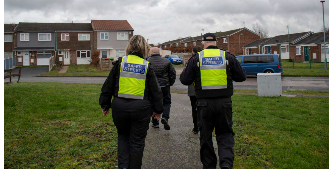
Engagement at Holiday Hills Park, Kirkby