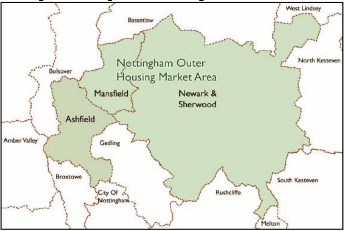
Figure 2 – Nottingham Outer Housing Market Area

3.3 As part of the duty to cooperate, the Outer Nottingham Area local authorities (Mansfield, and Newark and Sherwood) have been consulted on the revised SHELAA methodology adopted by Ashfield District Council (ADC). There is ongoing dialogue and a Statement of Common Ground<sup>3</sup> to inform and shape the respective local plans and evidence base documents.