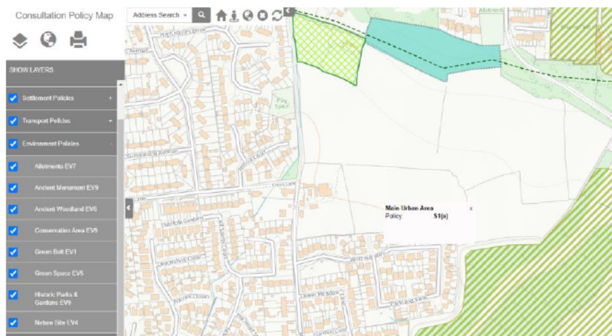
Figure 1 – Extract of the interactive proposals map

The interactive proposals map associated with this consultation confirms that the site is located within the 'Main Urban Area' which relates to Policy S1(a). There are no other policy designations which cover the site and prescribe policies of restriction or environmental sensitivity.